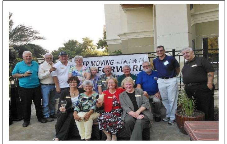
The AVA Regional Map (left) The 2015 – 2016 AVA National Executive Council relaxing post-meeting in San Antonio, TX (right).