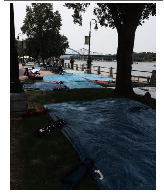
Right: LaCrosse Walk: Preparing for the Fireworks show over the Mississippi River