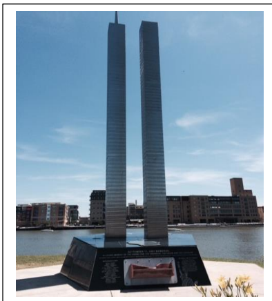
Green Bay Walk – July 19

The kiosk at the Verona Trailhead of the Military Ridge State Trail.