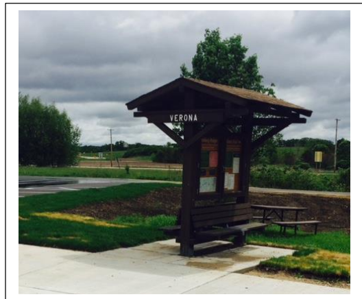
Verona Walk – August 15

The kiosk at the Verona Trailhead of the Military Ridge State Trail.