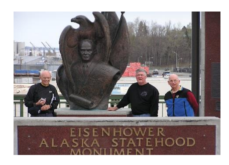
2007 Alaska Cruise