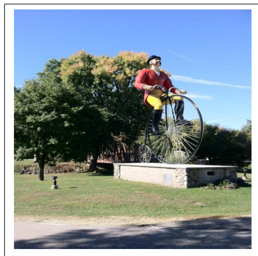
Left: DeForest Walk – Saturday, April 26, Yahara River Trail (see article on page 1) Right: Sparta Walk – Saturday, July 19 (see article on page 4)