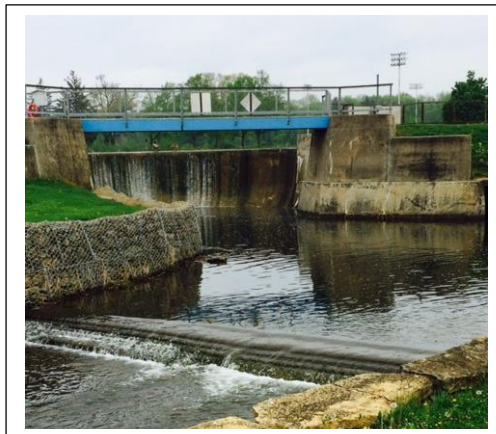
The Evansville railroad depot and the dam near the start point.