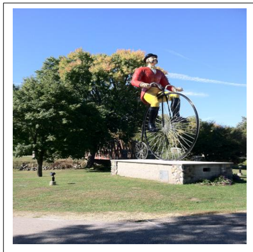
Left: DeForest Walk – Saturday, April 26, Yahara River Trail (see article on page 1) Right: Sparta Walk – Saturday, July 19 (see article on page 4)